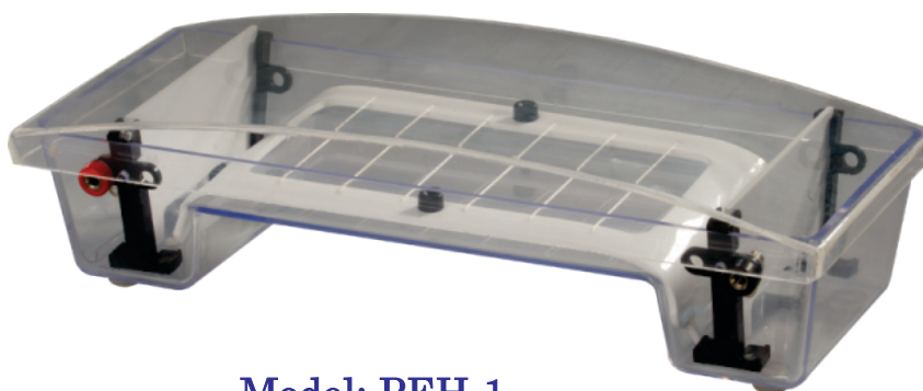
Model: PEH-1 Horizontal having 3 strips capacity.